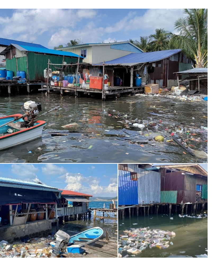
Presence of marine plastic pollution in Koh Sdach Archipelago (Feb 2022)

Waste separation was found to be low in HHs' waste management practice across both sites, with 94% of all HHs consulted in Koh Sdach and 57% in Koh Touch saying they didn't do it. However, most of the HHs in both places (76% in Koh Sdach, 71% in Koh Touch) stated that their waste was properly packed prior to disposal, meaning no leakage took place during transport to disposal point. Those who reported not properly packing their waste (24% in Koh Sdach, 29% in Koh Touch) tended to be HHs living above the ocean who would dispose of the waste immediately after it was produced.