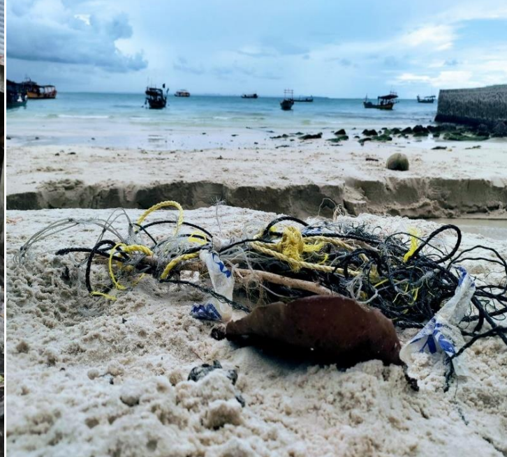
Presence of marine plastic pollution in Koh Touch, KRA (2022); credit: (left) Enrico Barilli / FFI; (right) Majel Kong / FFI