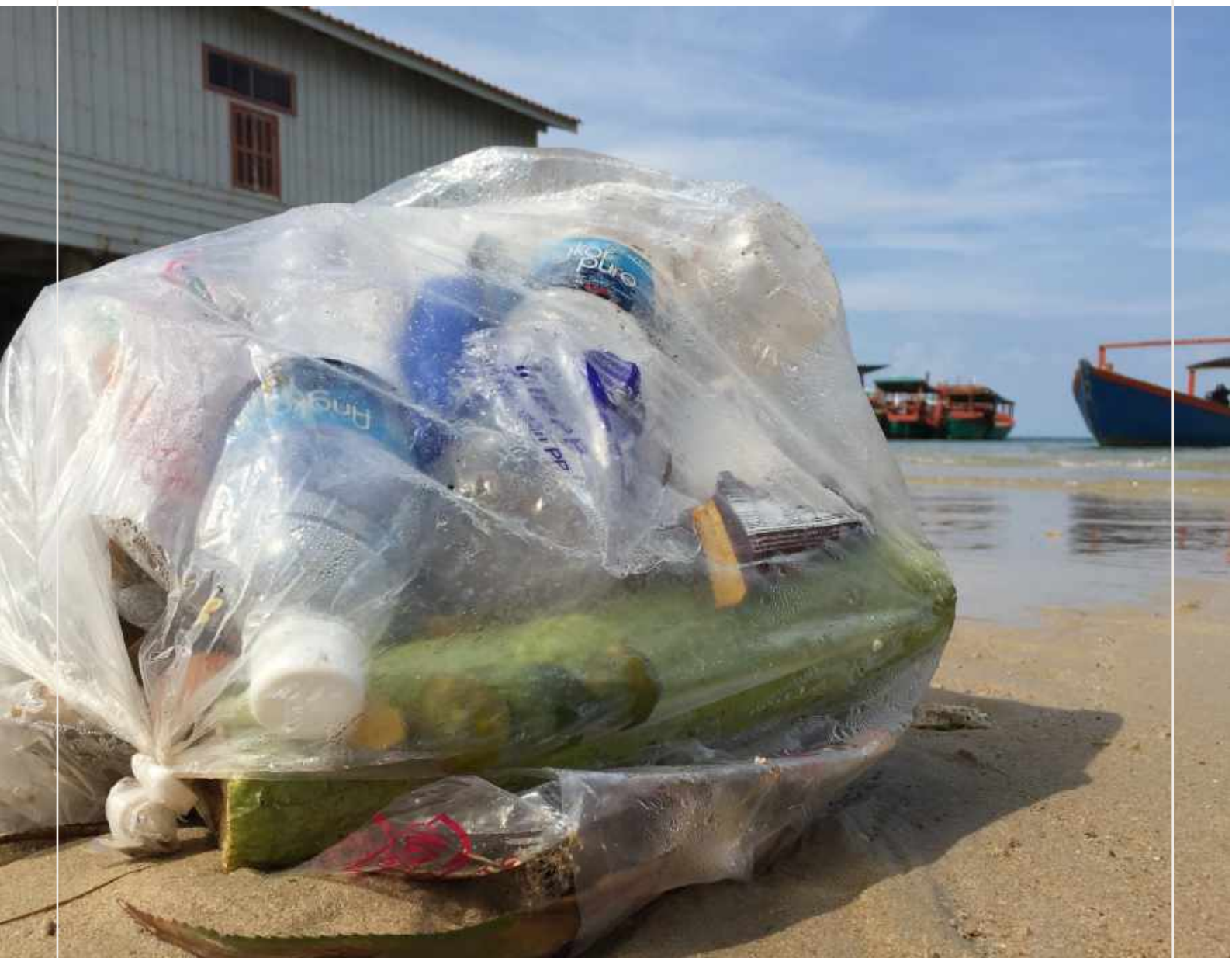
A bag of rubbish on a popular tourist beach in the Koh Rong Archipelago.

Finally, the findings highlight the critical need for Cambodia to adopt circular economy approaches. The circular economy model is targeted at moving beyond the current take-make-waste extractive model of linear resource use, towards a closed loop use of circular resource use that aims to eliminate waste (24) – a vision that requires iterative, large scale and systemic change. This report considers interventions through a circular economy lens, identifying feasible opportunities to reduce, reuse and recycle across the plastics lifecycle to support movement away from linearity, with the ultimate goal of reducing marine plastic pollution.