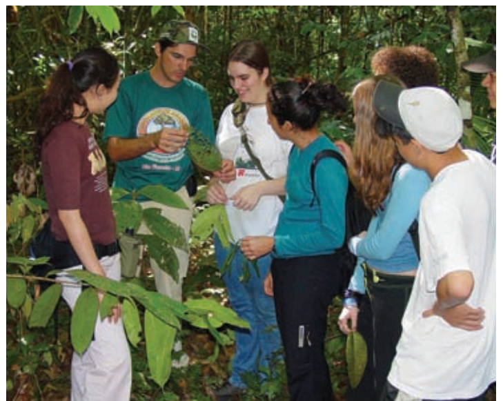
▲ Learning about the forest.