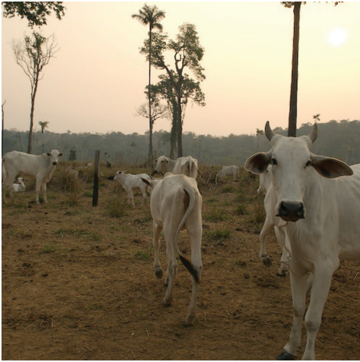
▲ Cattle on cleared land around Cristalino State Park.