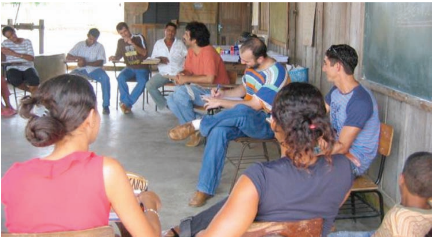
▲ Community workshop in Carlinda.

The project team recognise that halting the northerly progression of agricultural expansion into the Amazon is not a task that can be achieved in a few short years. But they believe that a process such as that described here which has provided sound local examples of community empowerment for conservation and sustainable development can be a seed for wider change.