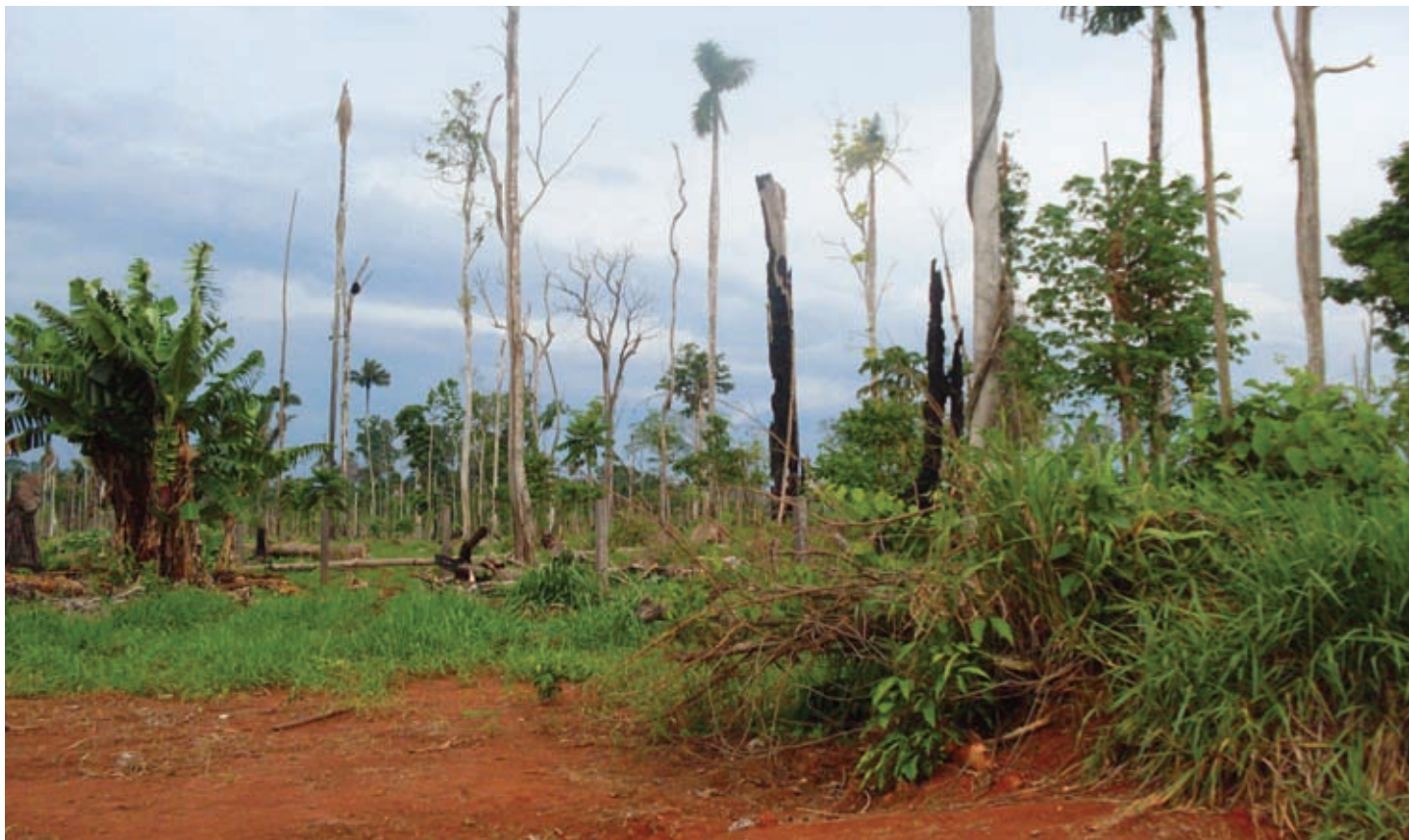
▲ Forest cleared for agriculture in Cristalino State Park buffer zone.