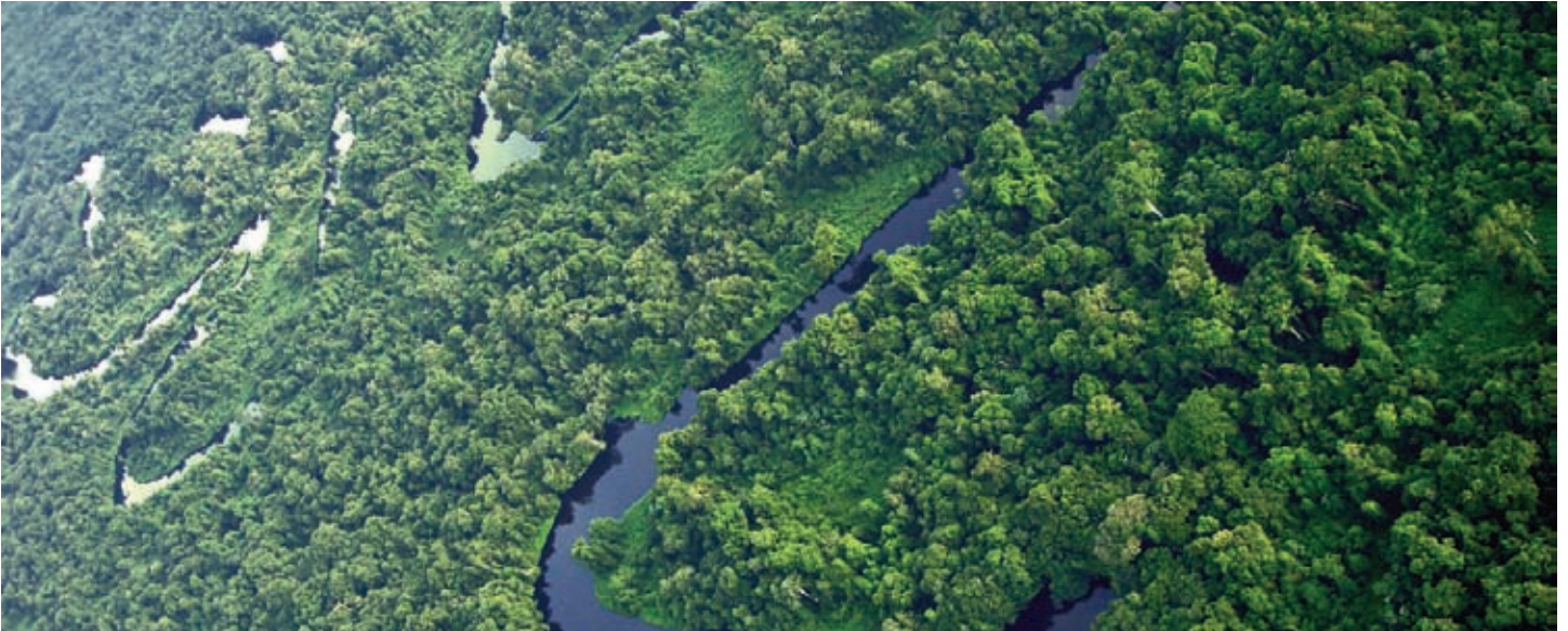
▲ Aerial view of the Cristalino River.