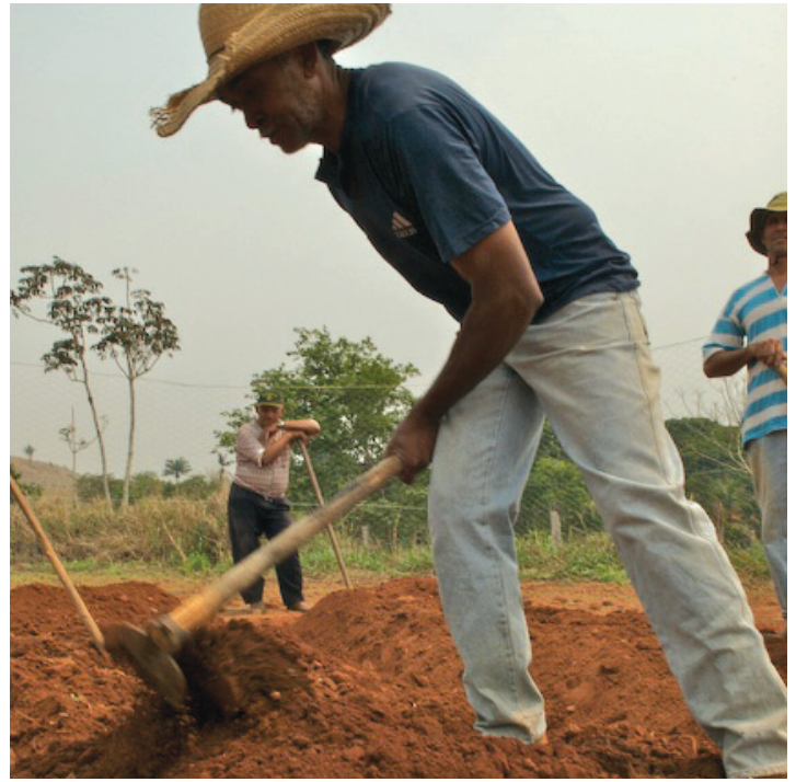
▲ Farmers develop a demonstration plot on a farm in Carlinda.